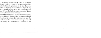
FIG. 3. Types of bipolar cells in the retina...

...the retina can be used as a... ...the retina can be used as a... ...the retina can be used as a...